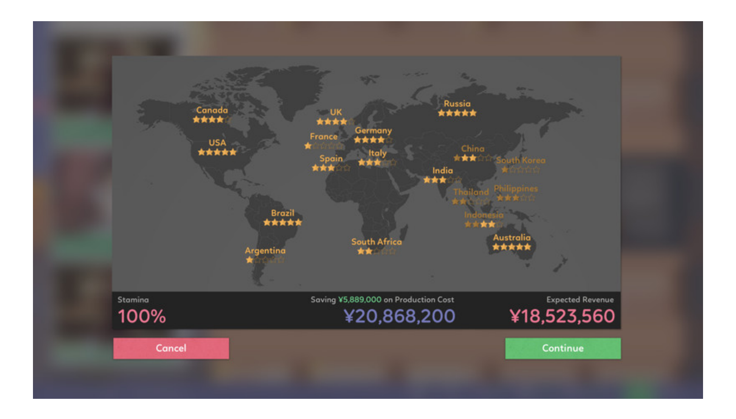
Idol Manager Download For Pc [portable Edition]

Download >>> <a href="http://bit.ly/2SN0URw">http://bit.ly/2SN0URw</a>